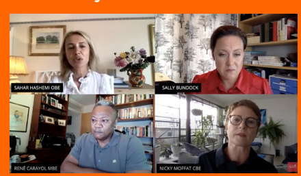
New Times Require New Leaders