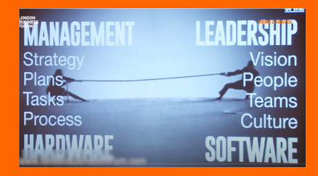
Leadership vs Management